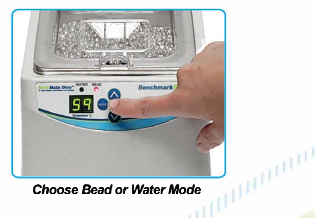
Choose Bead or Water Mode

Unlike any other laboratory bath, they feature a "MODE" button that can be used to toggle between "Bead" or "Water" mode. Choosing the correct mode will regulate the internal heating system, automatically adjusting the operation and balance of the multiple internal heating elements to ensure optimal performance. The result is one combination bath that is suitable for accurate and uniform temperature control in either condition.